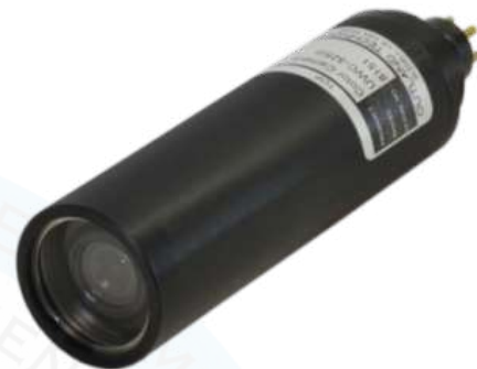
PART NO : SY-UWC-325/p/e