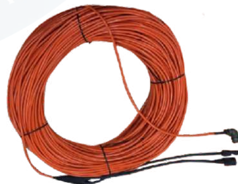
PART NO : SY-VC-150M (length)