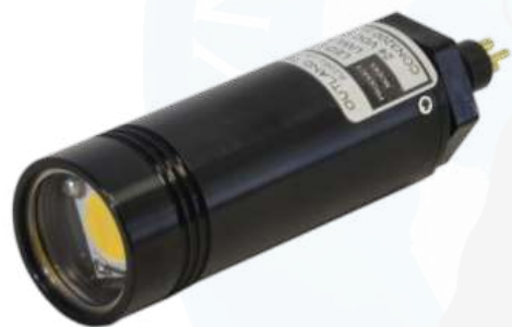
PART NO : SY-UWL-401