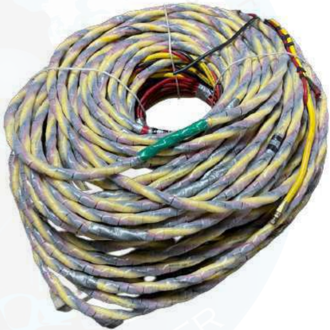
Diving Umbilical with spiral wrap