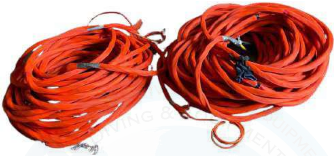
Diving Umbilical with protective outer sheet