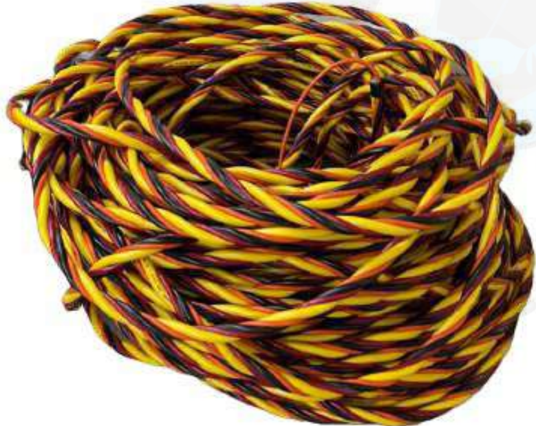
Diving Umbilical without protective outer sheet