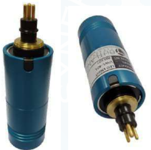
PART NO : SY-UWL-401